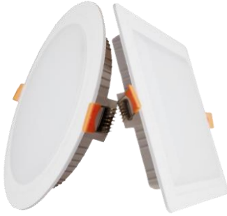
Tulip Sensor Light Motion Detection Range

(LED light with Dimming Microwave Motion Sensor)